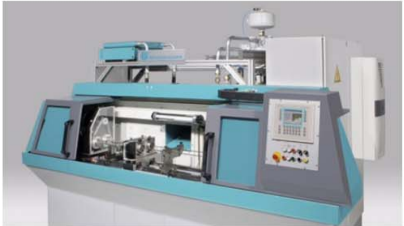
A TBT ML200 manually-loaded, twin-spindle deep hole drilling machine, two of which are being supplied by Kadia Inc to DC Machine in Summerville, Charleston, SC

TBT gun drills are suited to producing long small diameter holes on conventional machining centers and lathes. When using a gun drill on these types of machines a pilot hole must be first drilled to guide the tool.